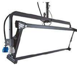
Celeb LED with Pole-Op