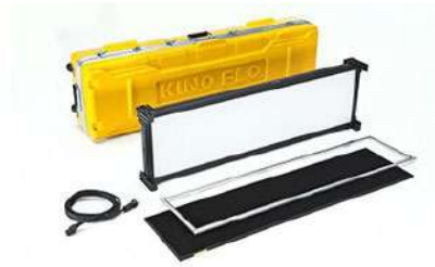
KIT-C401-120U Celeb LED 401 DMX Center Mount Kit, Univ 120U