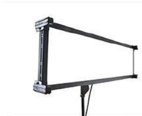
Celeb LED w/ Center Mount