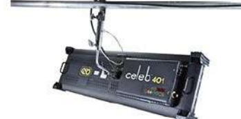
Mounted to pipe grid

The Celeb LED 401 Center Mount includes a ball and socket design and lock down handle. It allows unrestricted 360° or At the other end of the Center Mount is a junior pin lollipop, MTP-LM (28mm), which can go directly onto a junior stand or a pipe grid with a junior pipe clamp.