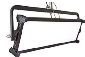
Celeb LED with Yoke Mount