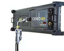
Mounted on a junior stand

The Celeb LED 401 DMX fixture styles include: Center Mount, Yoke Mount and Pole-Op. The compact design is only 5" in depth comprised of a rugged metal alloyed fixture with built-in electronics. The fixtures include a built-in reflector, removable gel honeycomb louver. The molded accessory holders hold the gel frame and louver and also allow for a 4-point rope hang.