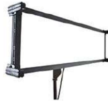
Celeb LED 401 DMX Fixture