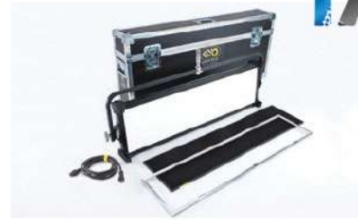
KIT-C401Y-120U Celeb LED 401 DMX Yoke Mount Kit, Univ 120U