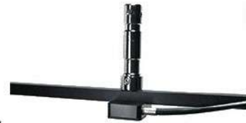
Jr. Pin (Included)

The Celeb LED 401 Pole-Op fixture includes a yoke with an attached junior pin. They can be hung from a grid with a Junior Pin. The blue cup alters the Pan (left or right) and the white cup alters the Tilt (up or down).