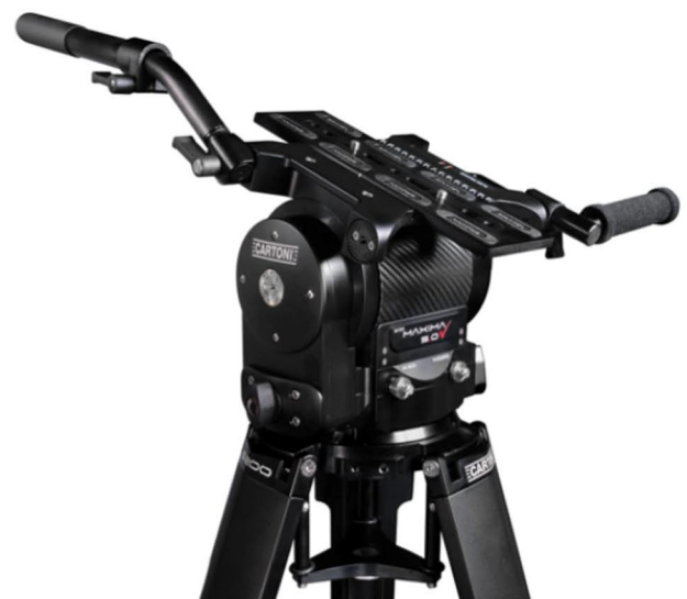
WITH PAN BAR

The MAXIMA 5.0 knobs and levers have been ergonomically placed for operator ease of use. The tripod head is suitable for studio, location, or outside shooting. The large sliding camera plate is compatible with ARRI, Sony, and O'Connor. The head comes with a telescopic pan bar and a short front pan bar.