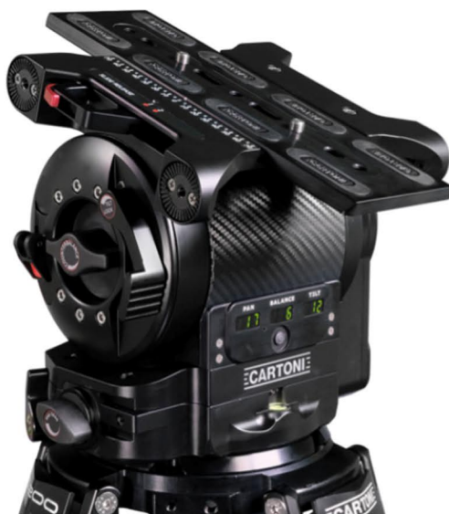
WITHOUT PAN BAR

The tripod head weighs in at 13 kg (28.6 lb) and it certainly looks to be a nice alternative to offerings from both O'Connor and Sachtler.