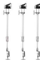
Type 635187 Extension Arms (Set of 3)